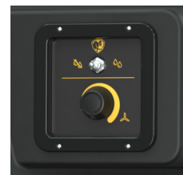
Onboard Variable Speed Control